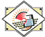
Business, Management, Marketing & Technology